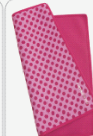
Pink polka dot