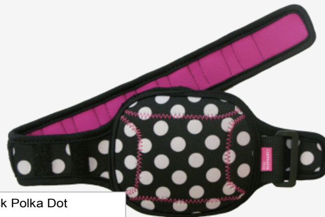
Black Polka Dot

Pink Elephant Photographer knee pad 2,415 JPY(tax included)